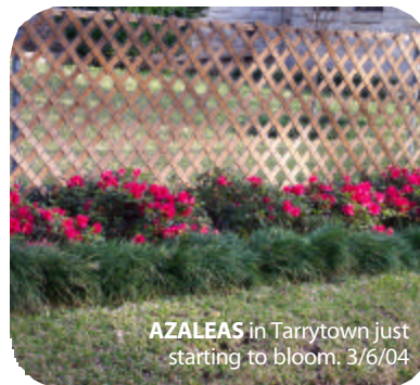
AZALEAS in Tarrytown just starting to bloom. 3/6/04